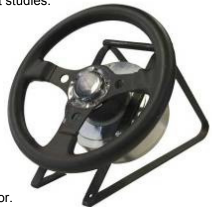
Desktop control loading system.

You have the power to configure SimForce to represent the vehicle you need. SimForce is available as a standalone product or included in the design of a complete simulator.